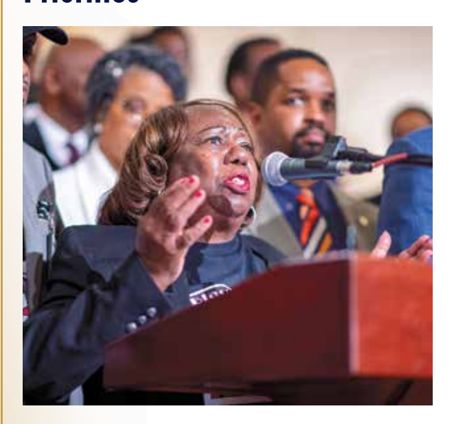
Sen. Street and Chair Bullock hosted the Black Clergy of Philadelphia and Vicinity at the Capitol for a PLBC roundtable about gun violence prevention and education. Rev. Maxine Collier speaks at a news conference with Sen. Street and other clergy in the background.