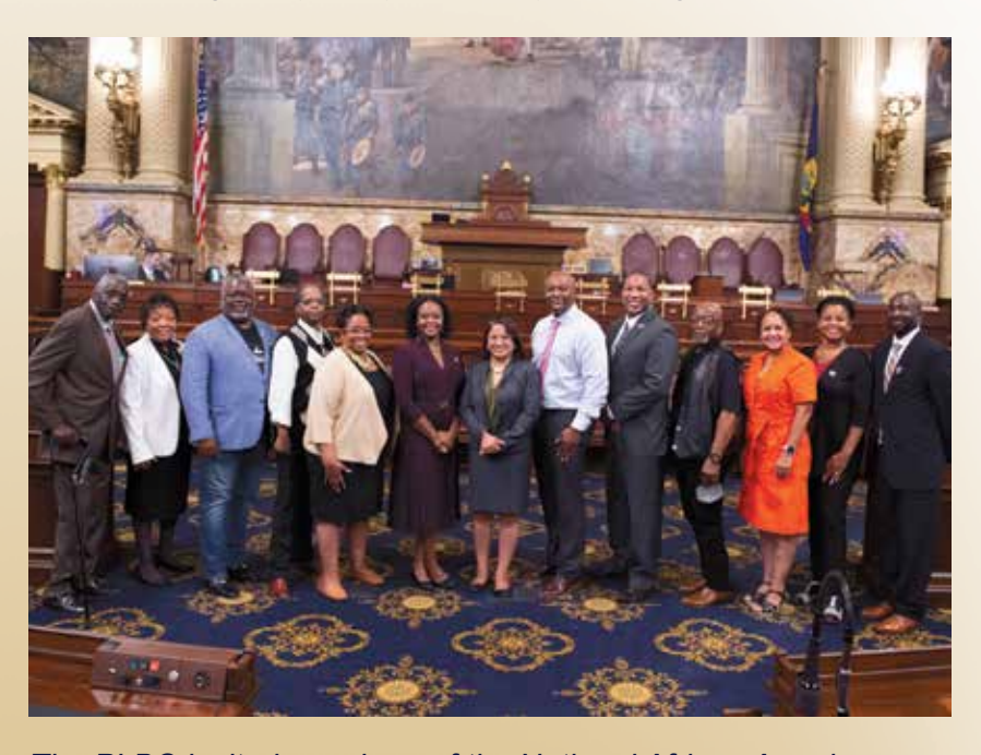
The PLBC invited members of the National African American Gunowners Association to the Capitol to discuss Second Amendment rights for Black Pennsylvanians, gun violence prevention initiatives, and economic participation in the firearms industry.